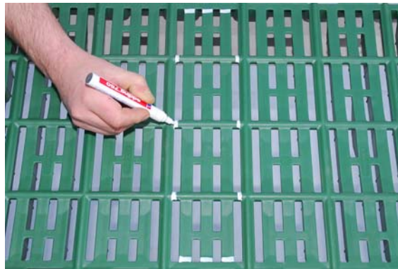
1. Mark the part to be cut out.