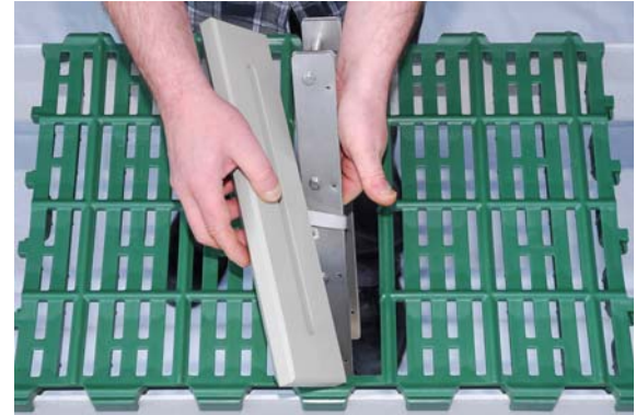
5. Insert the box into the opening.