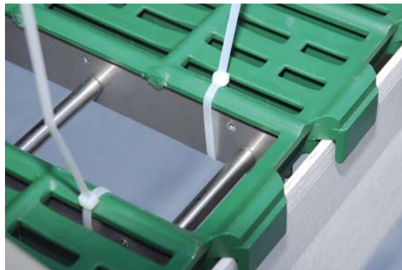
7. Fix the box with cable straps.