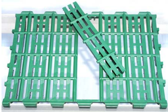
3. Panel with opening and cut out part.