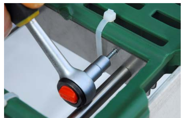
11. Tighten the screw with a box spanner.