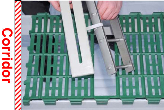
4. Align the block with the corridor side.