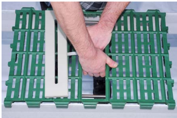
6. Pull the box tightly in the correct position.