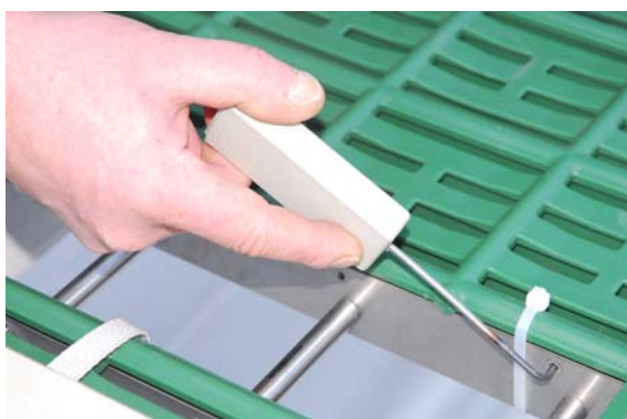
9. Heat up the tool with a flame and melt small holes into the box. Push the head of the tool completely through the box and panel.