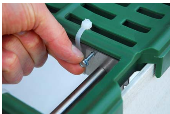
10. Set in the screw immediately after welding when the plastic is still soft.