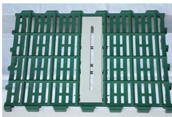
13. Finished installation!