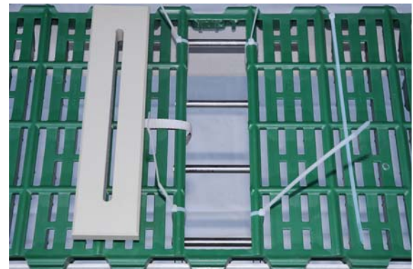
8. Box fixed with 4 cable straps.