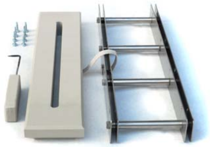
Items contained in the set

The solution for upgrading your existing panels